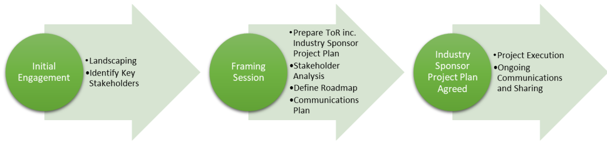
Figure 4. Industry Sponsor Project Set Up Approach

It is estimated that a period of circa 6 months, will be required from initial engagement, to final project plan approval (by all parties).