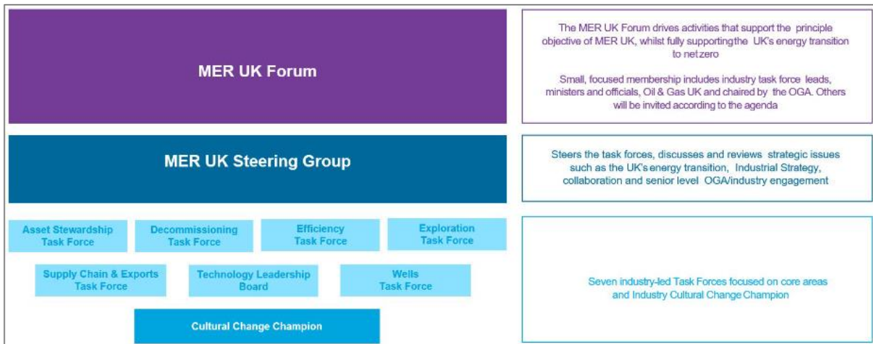
Figure 1. MER UK Forum & Task Forces

In September 2019 the Technology Leadership Board (TLB) launched their strategy and ambition for the UKCS 1 . The technologies strategy defined in collaboration with the Maximising Economic Recovery UK (MER UK) Taskforces (Figure 1), identifies the key opportunities and challenges. Deployment of innovative technologies is deemed critical for our industry, to ensure MER UK and deliver against the challenge of Net Zero.