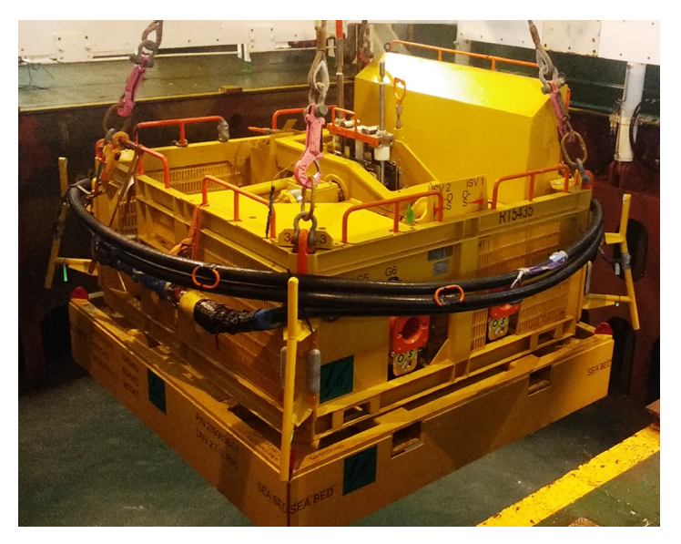
Subsea safety module with integral mudmat deployed on wire.